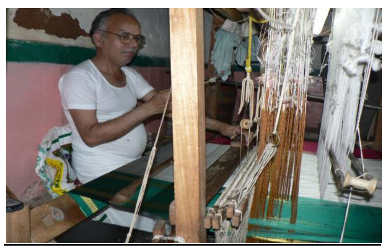
Molakalmur Kuttu saree on Pit loom